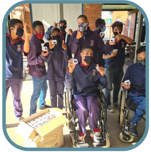
OPENING OUR BOX FILLED WITH VEGGIE PODS!